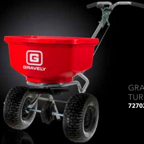
GRAVELY TURF SPREADER 72702800