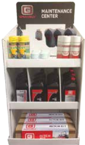
GRAVELY ACCESSORY DISPLAY 70712500