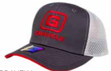
GRAVELY BASEBALL CAP 05110000

Use this gauge display to show a customer the difference in deck steel thickness between Ariens or Gravely units and their competitors.